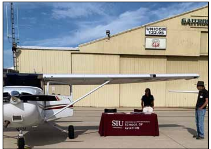
Saluki pilots and students have been busy attending some local events to promote the School of Aviation. Top picture is in Fulton, KY at the recent educational event at the airport and the bottom picture is at the Air Show in Decatur, IL. Our crews were also seen at Sun N Fun in Florida and OshKosh, Wisconsin this past spring and summer.

It's always nice to see alumni and prospective students visit our table.