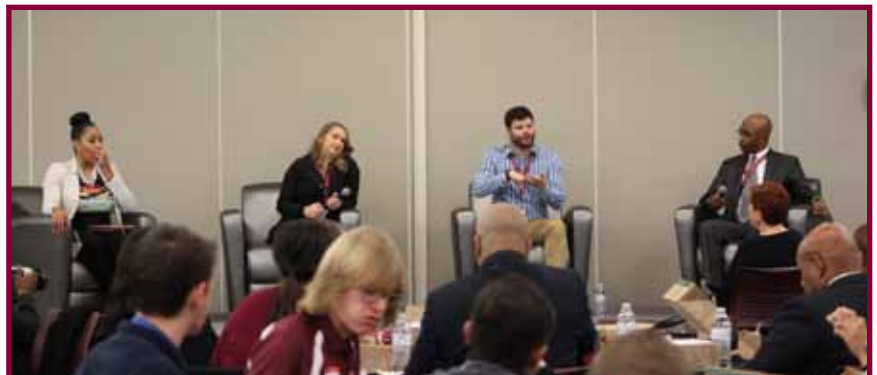
The diversity panelists discussing different topics and questions addressing diversity in the workplace.