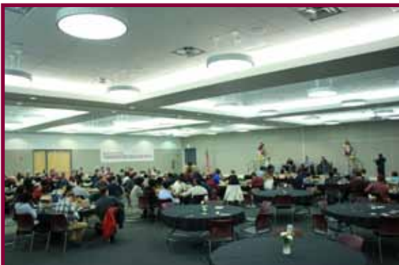
A large crowd attended the First Diversity Luncheon.